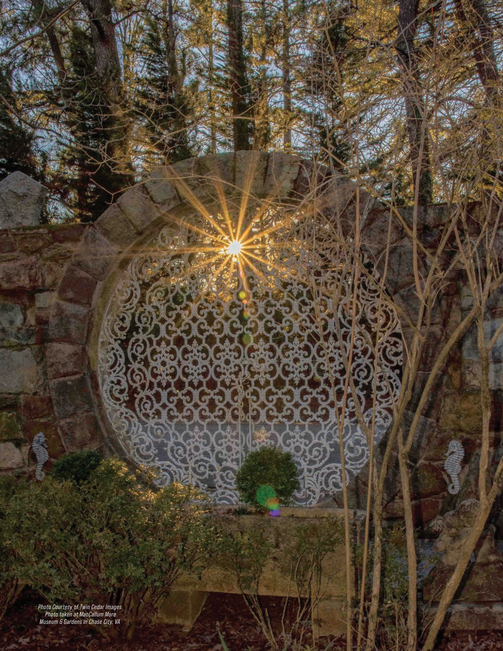
Photo taken at MacCallum More Museum & Gardens in Chase City, VA