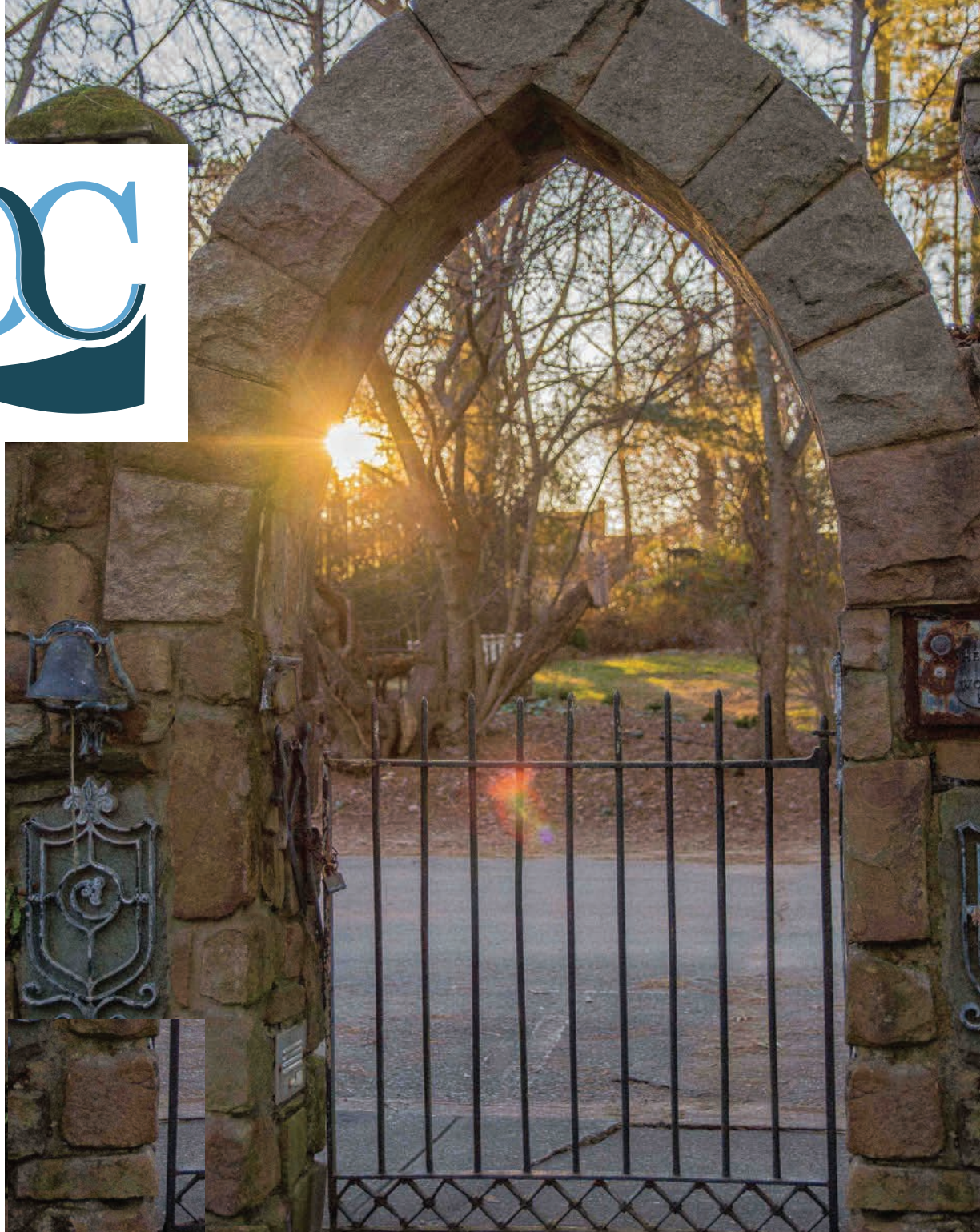
Photo taken at MacCallum More Museum & Gardens in Chase City, VA